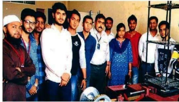
भूकंपामुळे निर्माण होणाऱ्या लहरीचा इमारतीवर होणारा परिणाम समजण्यास मदत करणारा प्रकल्प सादर करताना सिंहगड अभियांत्रिकी महाविद्यालयातील विद्यार्थ्यांचा चमू.