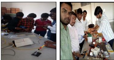
Photos from Training Program