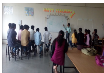
PLC & Introduction to SCADA