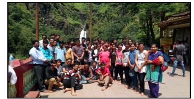
Industrial Visit Photos