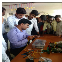
Solar Testing, Installation & Automation