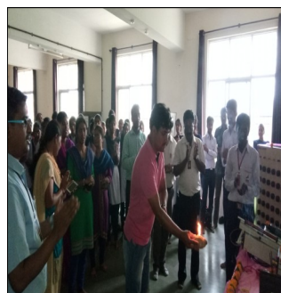
Khande Navami Pooja