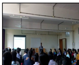
Induction Program Photos