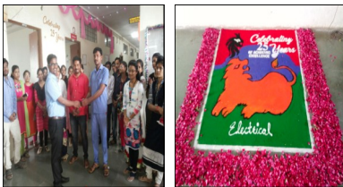
Photos from Celebration Function

As we know, 12 th August used to be the foundation day of Sinhgad Institutes and from 12th August 2017 Sinhgad Institute has entered into its Silver Jubilee Year. As this is very special year for all the students and employees of this huge institute we are celebrating it in different ways. From 7th August to 12th August 2017, we organized different activities like Giving Day, Blood Donation Camp, Dept. decoration competition etc.