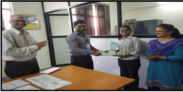
Technosinh– felicitation of Alumni