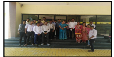
Industrial Visit Photos