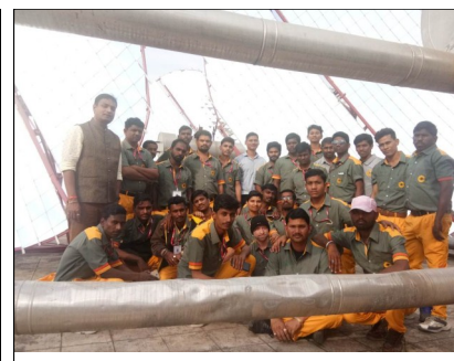
Suryamitra: Skill Development Program