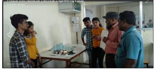
Pics @ Lab Innovation