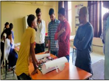
Judging of posters by our Alumni