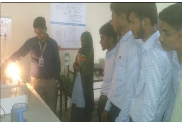
Pic @ lab sessions for Malauna Azad Polytechnic students