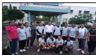
NBNSOE, Girls volley ball team got 2 nd prize in university level tournament.