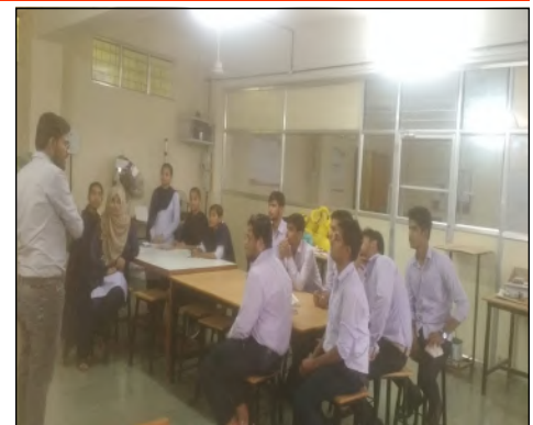
Pic @ lab sessions for Malauna Azad Polytechnic students