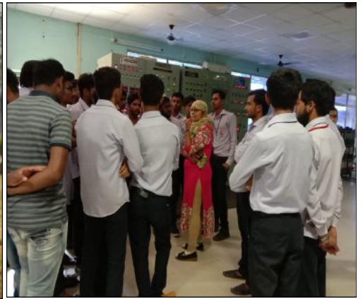
Visit to Bale substation for SE EE Students