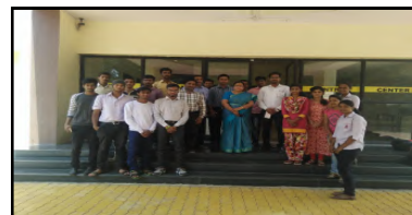
Industrial Visit Photos