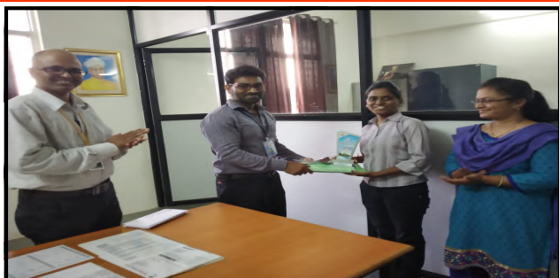
Technosinh- felicitation of Alumni