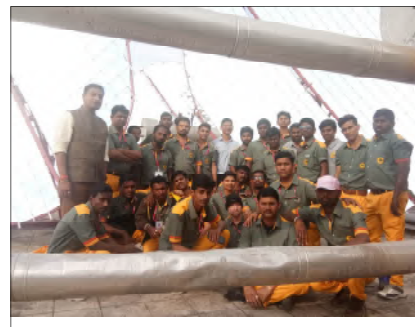
Suryamitra: Skill Development Program