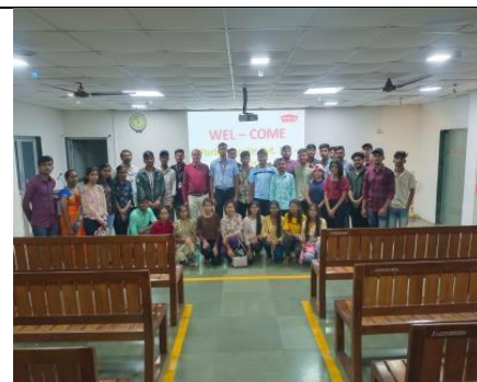
Parle Biscuits PPT

The Industrial visit of 2025 Batch E & TC students was organized on 6 th May 2024 at Parle Biscuits Pvt. Ltd, Khopoli Total 36 students visited it. The students were given practical information about the following facilities at Parle Biscuits Pvt. Ltd They were guided by the supervisor of Parle Company, and a demo was given by the supervisor on PPT. Student get the information about the sensors and learned the automated PLC based.