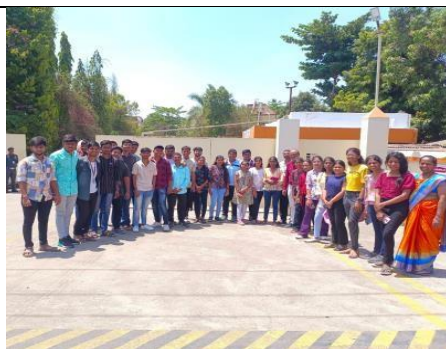
Parle Biscuits Industrial Visit