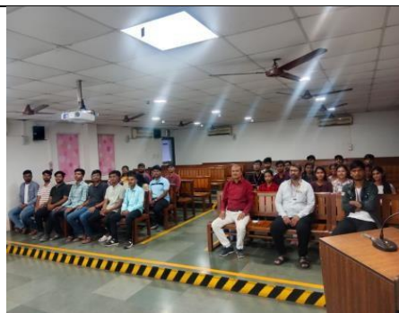
Parle Biscuits PPT